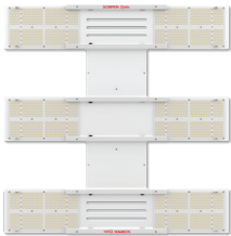
• HLG SCORPION DIABLO Spec Lamp