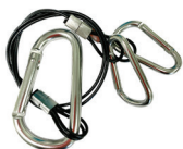
• Hanging hardware